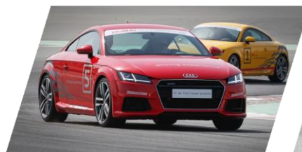
Audi TT Drive